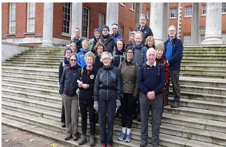
The strollers outside Osterley House

It was tempting to linger in the warm café but, as the darkness began to fall, we headed away from the noisy traffic to St. Nicholas's Church to take in Hogarth's tomb before following the river along Chiswick Mall. These handsome Georgian houses have housed many famous names, including the Walpole family, William Thackeray and the Redgrave family. Further along in Upper Mall Kelmscott House was the home of poet, designer and craftsman William Morris until his death in 1896. We eventually emerged from the historic atmosphere of the towpath to the clamour of the Broadway. Here we went our separate ways, taking with us pleasant memories of the parks, canals and riverside.