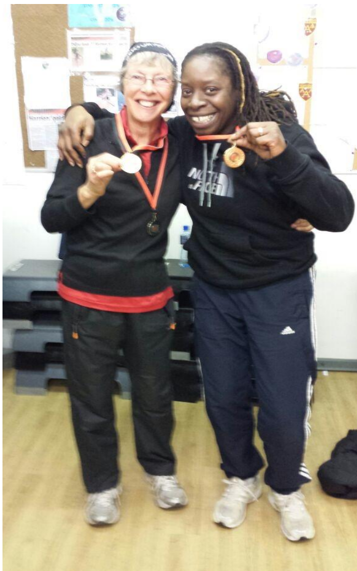
Two Sandras – first team in SRWA 10kms